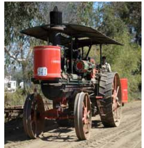
(L) 1902 Advance Traction Engine (Below Top to Bottom) 1898 Russell 1/4 Scale Case 1920 Minneapolis 20 HP

Here at this museum we have a lot of fun but always remember that we are the custodians of this equipment and need to take care of each and every piece.